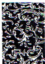
SCROLL 52 X 200cm $39.95

Some colouring of the paler fibre by the darker one is unavoidable, particularly with Yellow & Blue and Yellow & Black combinations. Please keep this in mind when choosing your colours. Monochrome dyeing (one colour) is possible by using matching shades of each dye, for monochrome black however double the dye measurement