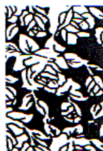
ROSE 34 X 150cm $32.90