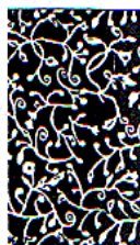
BLOSSOM 55 X 200cm