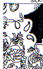
PERSIA 59 X 189cm